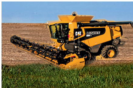
Fig. : Combine